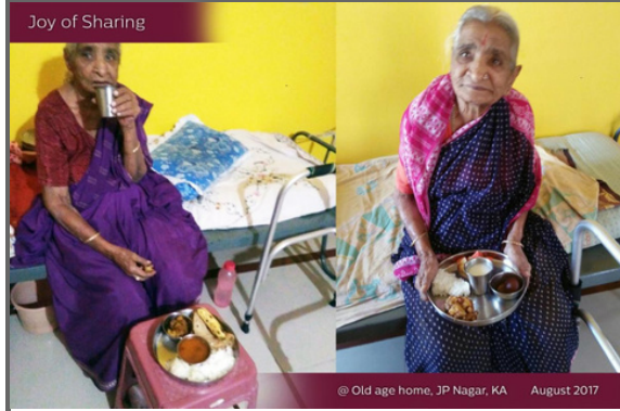
Joy of Sharing

In 2015, the Serve2Gether(HRM) initiative facilitated the pillars of the future by installing a reverse osmosis (RO) plant at a government school in J.P. Nagar, providing purified drinking water to the students.