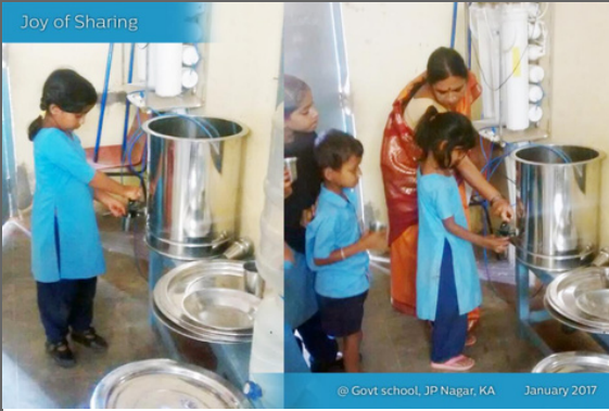
Joy of Sharing